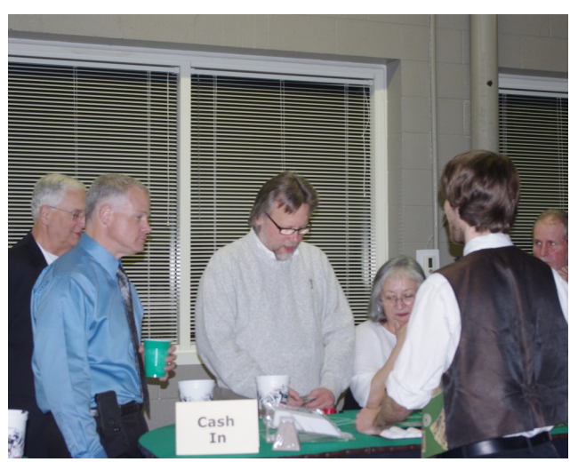
Black Jack Tables