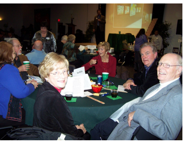
The Joe Willis Table.