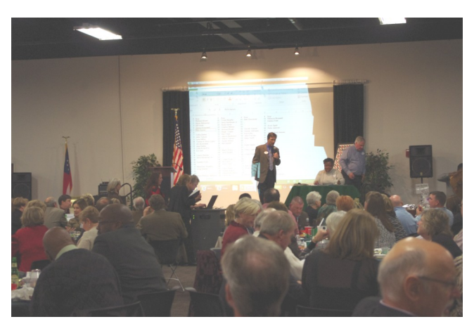
Number drawn for Last Jack Reverse Raffle; 80 of 100 raffle tickets sold allowed us to give $4000 in cash prizes and another $500 in prizes, such a beautiful wine basket from the Cork Boutique. 50% of the money from tickets sold goes into the prize pool..